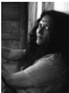
Deepa Mehta 2008 Honoree